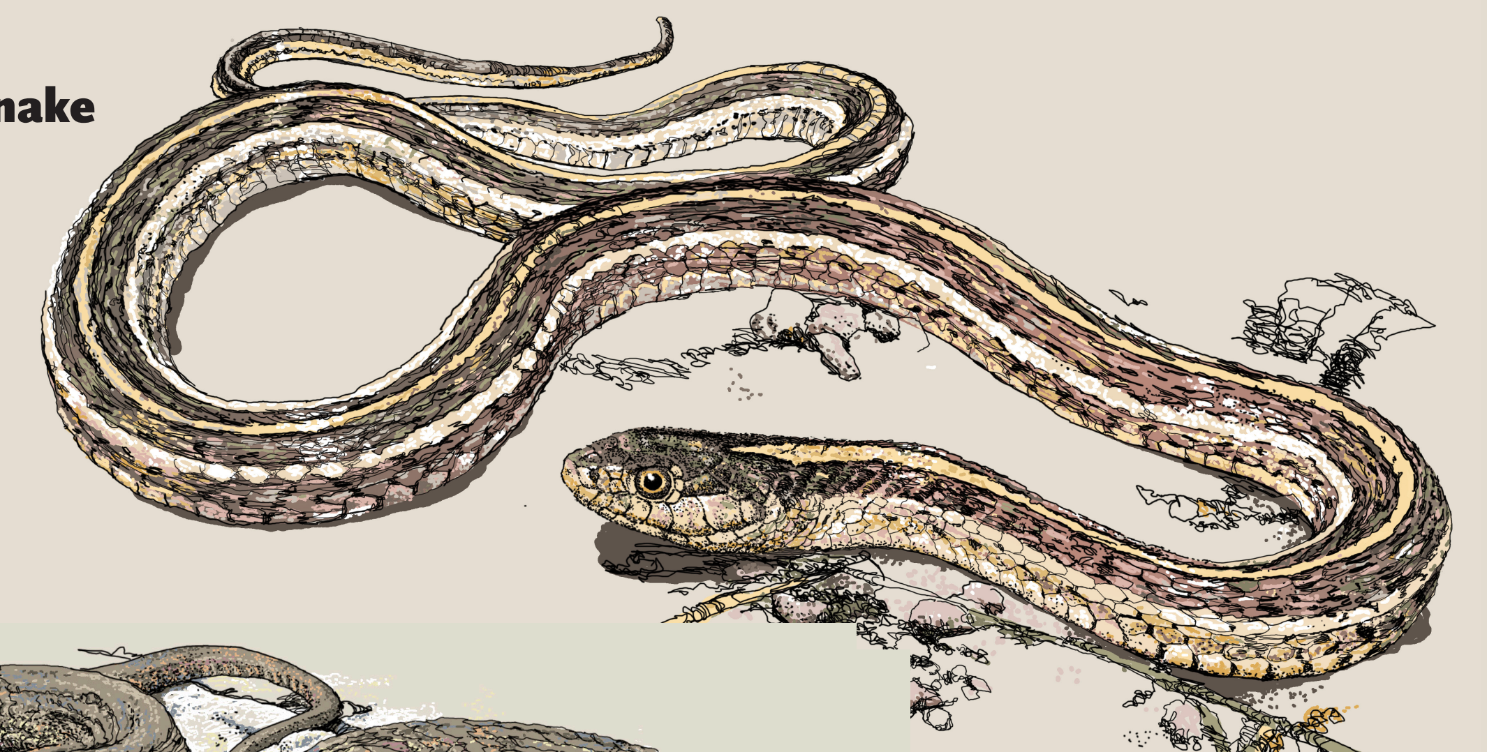
Northern Mexican Gartersnake

Dos especies de culebras garter no venenosas viven cerca de Oak Creek, donde ellas cazan peces pequeños. La culebra garter mexicana norteña (“northern Mexican gartersnake” en inglés) se encuentra en la parte baja de Oak Creek. La culebra garter de cabeza angosta (“narrow-headed gartersnake” en inglés) vive río arriba en el Cañón Oak Creek como una de las últimas poblaciones de su especie en Arizona. Es contra la ley molestar, recoger, herir o matar estos réptiles poco comunes. Manténgase en los senderos señalados para no dañar su hábitat ribereño.